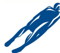
TABLE OF CONTENTS / TABLE DES MATIÈRES