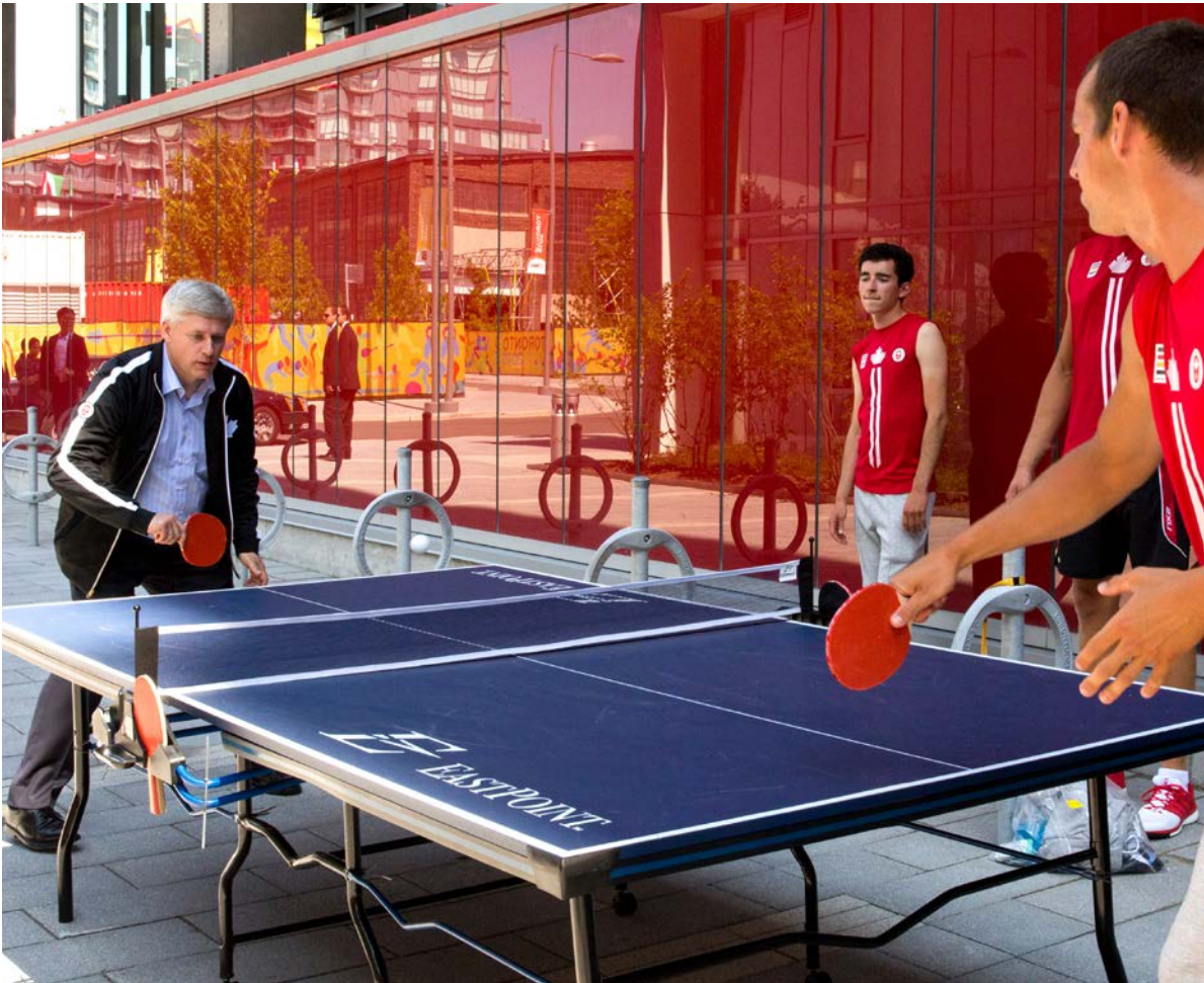
Left Prime Minister Stephen Harper stopped by the Pan Am Athletes' Village for a quick ping pong match against rower Matthew Buie.