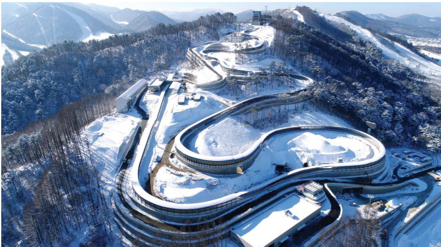
Above The Alpensia Sliding Centre in PyeongChang.